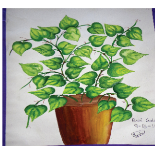
IXB - Ruchi Gala