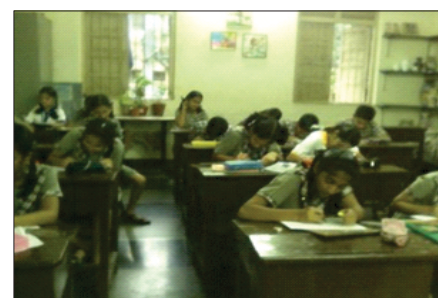
All India Art Talent