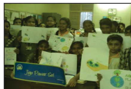
Tata Power Club