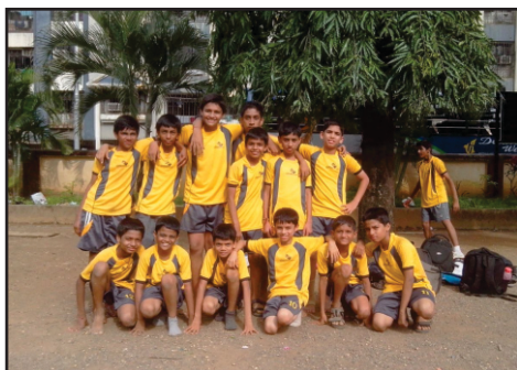
District Sports Competition