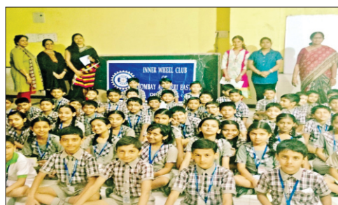
Workshop by Childline India Foundation